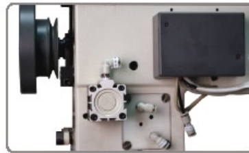
PNEUMATICAL FOOT LIFTER, BACKTACKING AND 2 STITCHES LENGTH SELECTOR